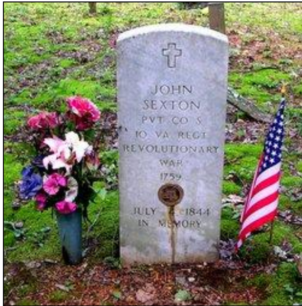
Sexton Cemetery near Viking Mountain Road

[Veteran was pensioned at the rate of $8 per month commencing October 6, 1819 for service as a private for 3 years in the Virginia Continental line. His widow was pensioned at the rate of $80 per annum.]