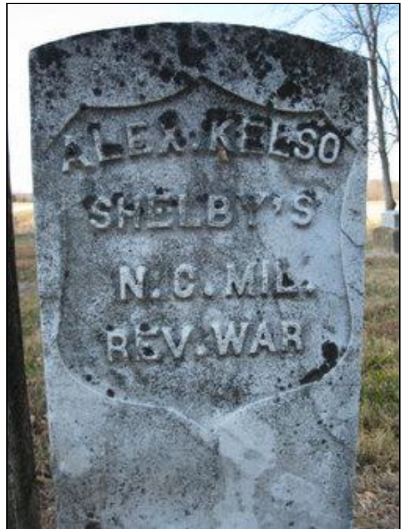
Boles-Williams Cemetery Morgantown, Morgan County, Indiana