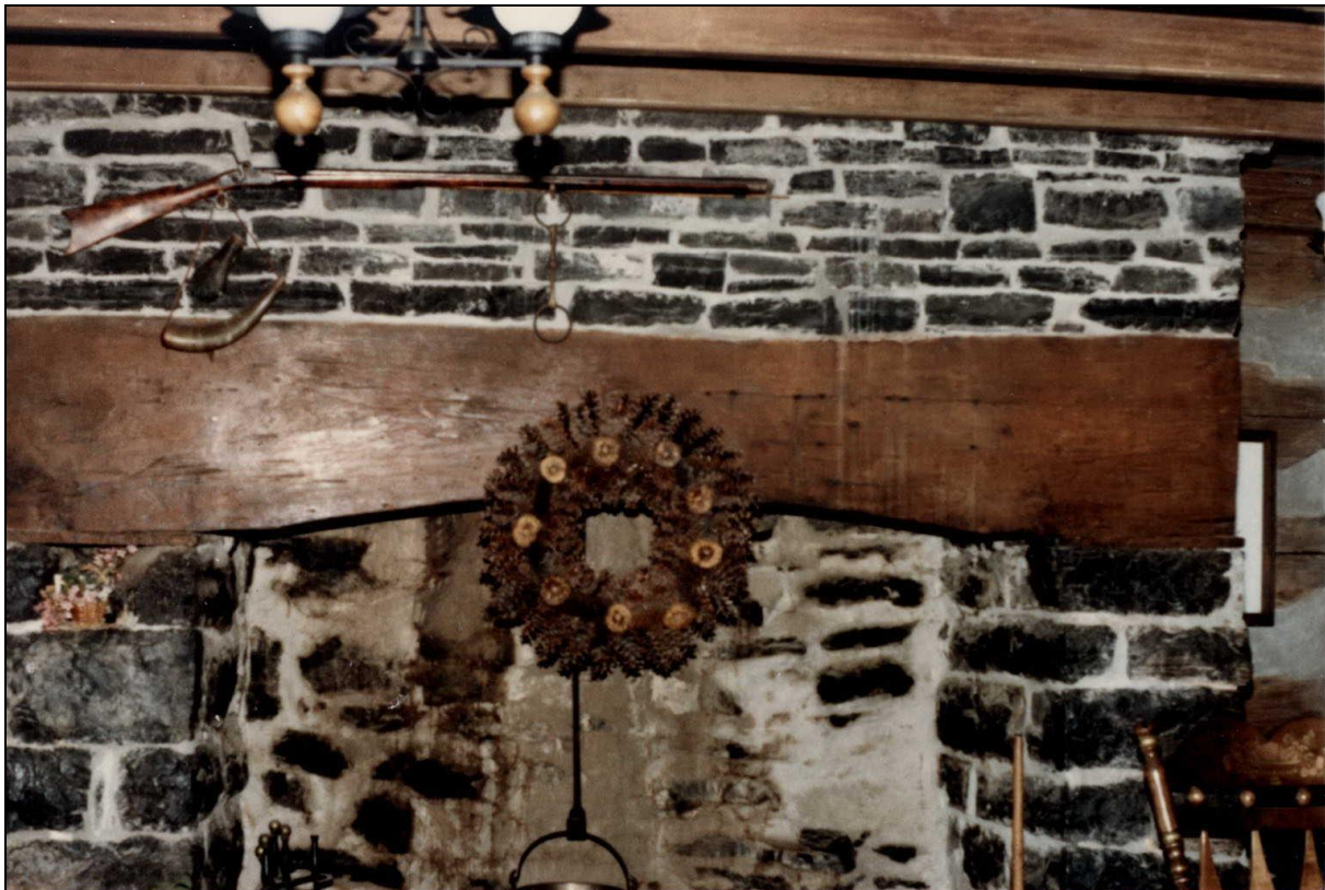
Massive fireplace in the McCollum Home.

The McCollum house still stands in the Newmansville area. It is a large two story house, located about 1/2 mile off Hy 93.