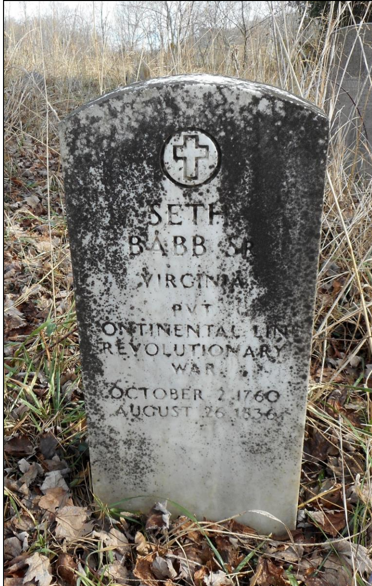
Babb Farm Cemetery, North Greene County