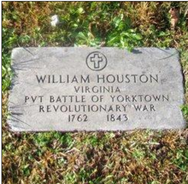
Pine Springs Missionary Baptist Church, Houston Valley Road