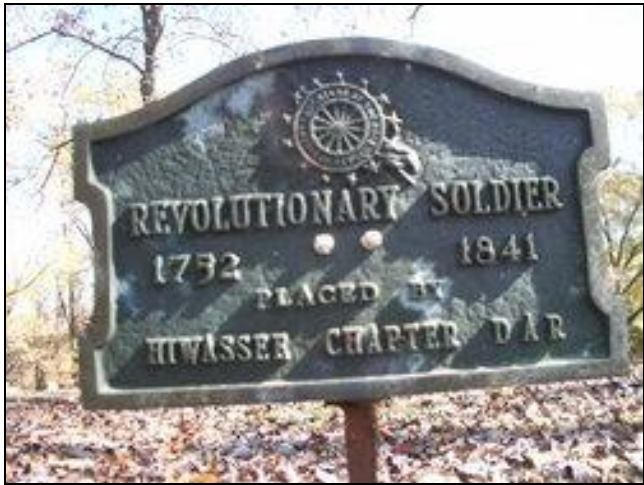
Fochee Cemetery Loudon County, TN