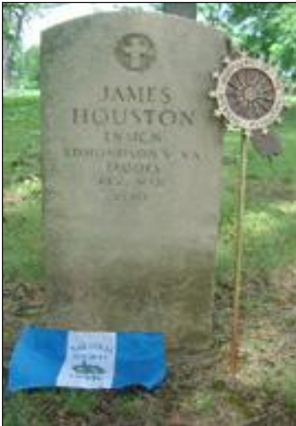
New Providence Cemetery, Maryville TN