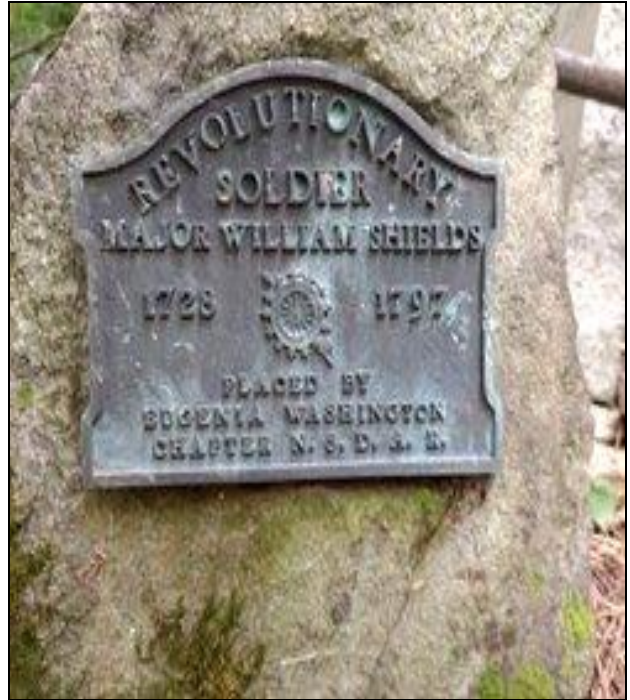
Shields Family Burying Ground Emmitsburg, Frederick County, Maryland

[History of Frederick County, MD Page C/S: IC K: 277 History of Emmitsburg] 1906]