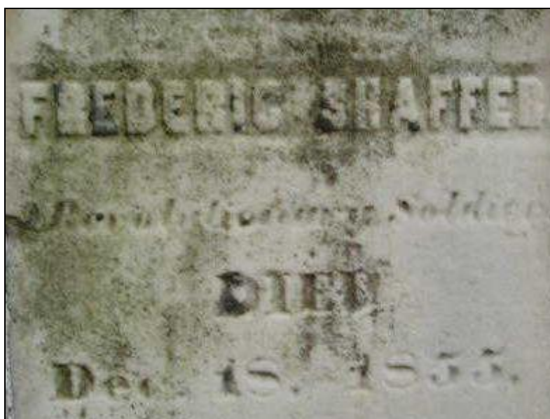
Gray's Cemetery Clinton County, Indiana