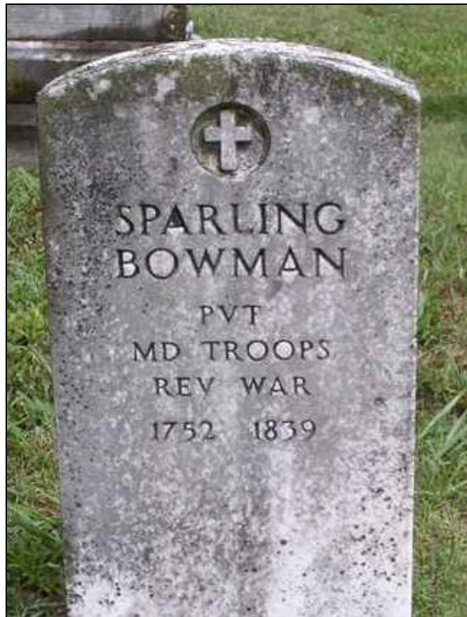
Zion Presbyterian Church Cemetery